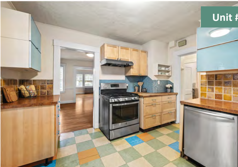
Unit #1 Kitchen