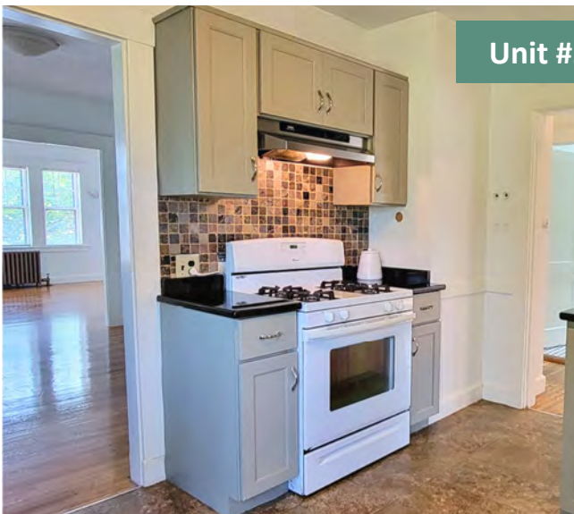
Unit #2 Kitchen