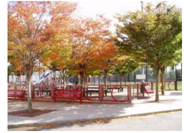
Conway Park Sports Complex

Floor Plan