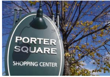
Shops, Restaurants & Subway