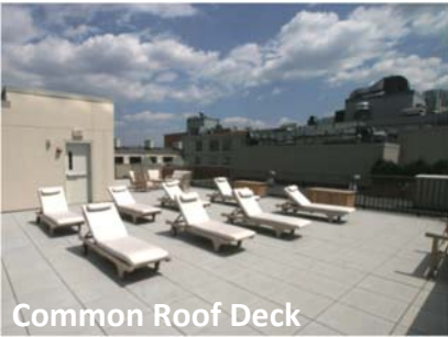
Common Roof Deck