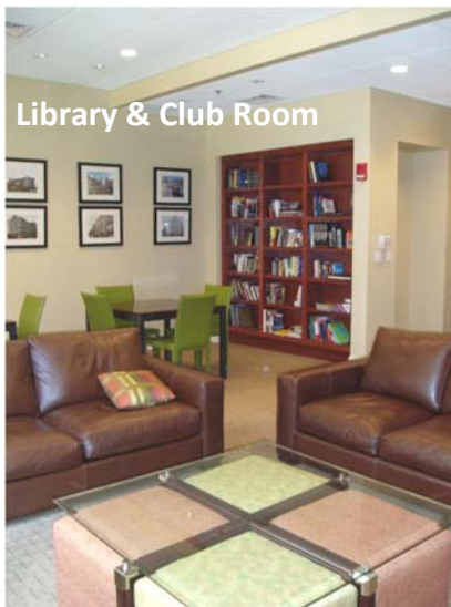
Library & Club Room