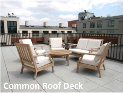
Common Roof Deck

Floor Plan