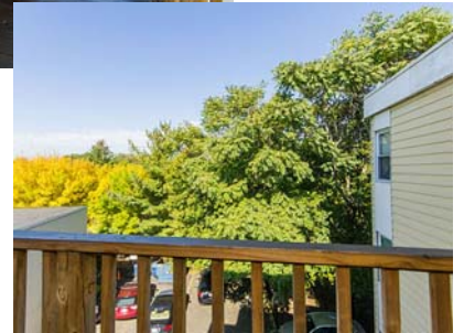
View from Back Porch