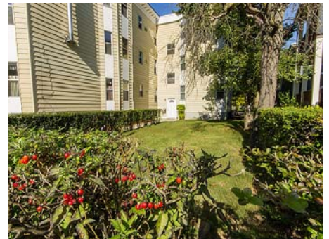
Shared Side Yard